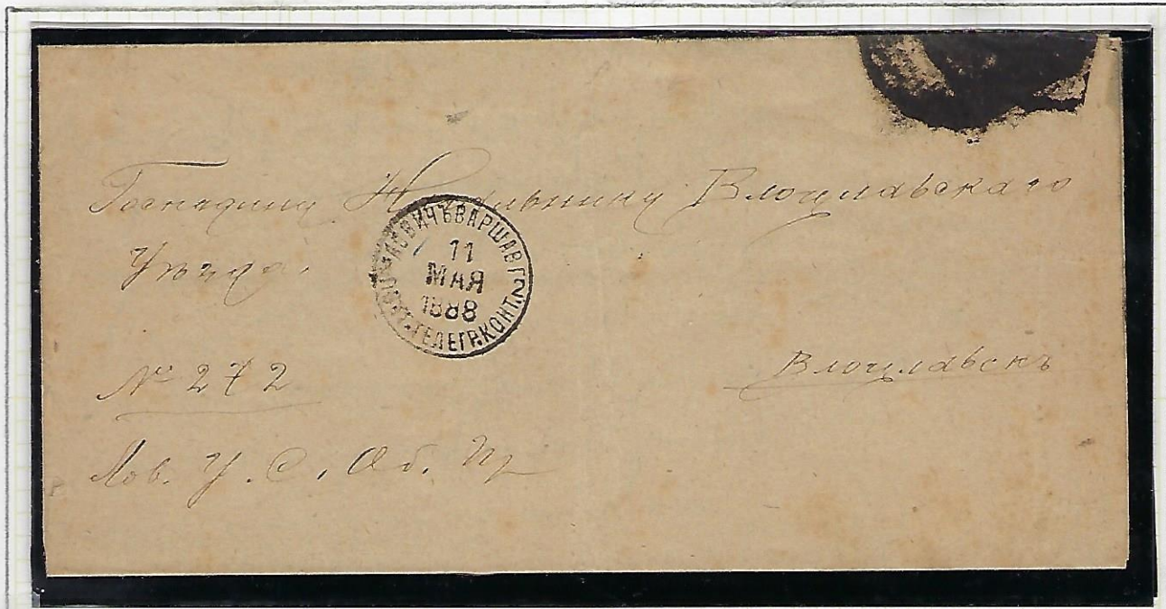
1888: A business letter in Russian, sent from Łowicz on 11 May 1888 to Włocławek, where it arrived the following day. Distance 84 km as the crow flies; perhaps 10 km further by the direct rail connection from Warsaw via Łowicz to Włocławek and from there to German Poland which was completed in 1862.

A LATE EXAMPLE OF MAIL FORWARDED WITHOUT STAMPS.