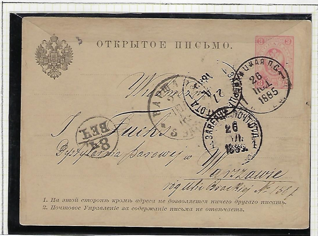
1885: Postcard with pre-printed 3 kop. orange stamp for local delivery (colours a bit faded). The small circular handstamp centre left is the marking for Warsaw evening postal delivery.