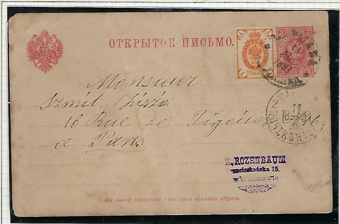
The use of (Russian) Postage stamps and (Russian) Postcards. Card, also featuring the Russian Double-headed Eagle, sent from Warsaw to Paris in 1891. The pre-printed 3 kop. stamp was sufficient postage for sending a post card within Russia, but the extra 1 kop. stamp was required for international traffic.

A POST CARD WITH PRE-PRINTED STAMP PLUS AN EXTRA, "ORDINARY" STAMP.